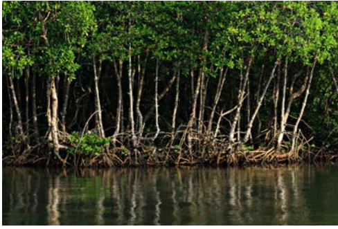
Mangrove forest in Chumphon Islands National Park, Southern Thailand