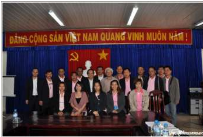
Figure 1: group photo with the invited speakers from Hanoi

In the morning session, three invited speakers from the Hanoi who are involved in policy development and one ARBCP staff provided information about development process of PES implementation in Lam Dong province, which is one of the two pilots sites for PES implementation in Vietnam. The discussed topics fall into four areas: 1) PES policy development; 2) identifying buyers and regulations for buyers; 3) identifying beneficiaries and the mechanisms to link the buyers and beneficiaries and; 4) benefit distribution of PES payments in the scheme.