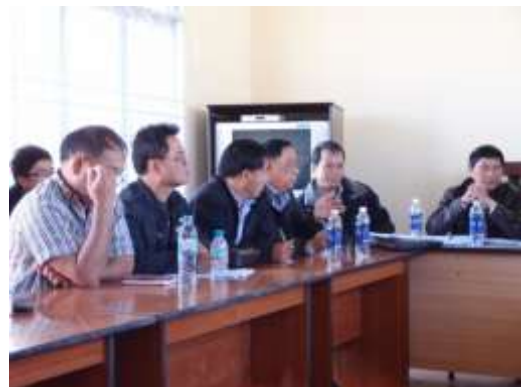
Figure 2: Local representative from Maesa-Kokma shared his experiences in forest management on Day 2

The discussion in the morning session took place at the meeting room of the Da Nhim commune. The Da Nhim Protection Forest Management Board (PFMB) first explained about their responsibilities and mechanism for channeling the PES fund to the households who participated in the PES program. Thai participants also learned how the PES project could involve local households in the area into the project through representatives from four villages participating in the PES project. This stimulated practical questions from the Thai participants, especially from the 5 representatives from the pilot site in Thailand.