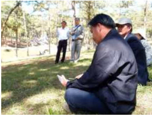
Figure 3: The village headman from Phanonkok, Thailand asked his question to the tourism company on Day 3

The first discussion in the morning took place at the meeting room of the "Lovely Valley" tourism company. The participants learn about the history of the company. The mechanisms how the company participated in the PES fund as well as their motivation for participating in the PES scheme were discussed. Questions related to the expectations from the company to the payment as well as the monitoring and verification of the changes in environmental services were raised by the Thai participants. The second meeting was with the deputy director of the "Lakeside" tourism company in the park. The participants received similar opinions and experiences about the PES mechanism from this company. Both companies referred to their awareness of the benefits to the poor and the importance of the natural ecosystem. The companies view the payment as part of their investment in their tourism operation. The Thai participants were skeptical about the value of the payments made by the companies to the PES fund. The companies highlighted an improvement in environmental services such as water from the PES program over the long term period in which one should not expect improvements of the services within the first three years.