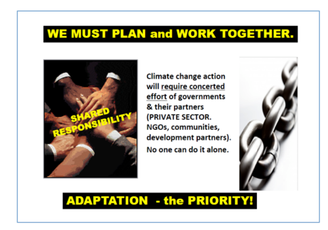
Figure I (Slide 23) Presentation from Ms. Elisea "Bebet" Gozun on Challenges for Climate Change Adaptation: National Perspective, showing the need to collaborate on climate change adaptation.

Ms. Gozun indicated that gaining strong political will is a challenge. She stressed that the local communities need further capacity development in many sustainable development areas, since they are standing in the front-line of climate change (see Figure 3 below).