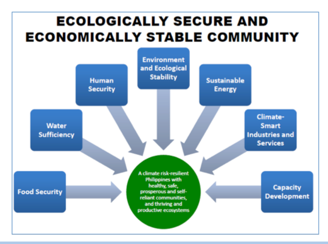
Figure 3 (Slide 27) Presentation from Ms. Elisea "Bebet" Gozun on Challenges for Climate Change Adaptation: National Perspective – illustrating the components of resilient communities.