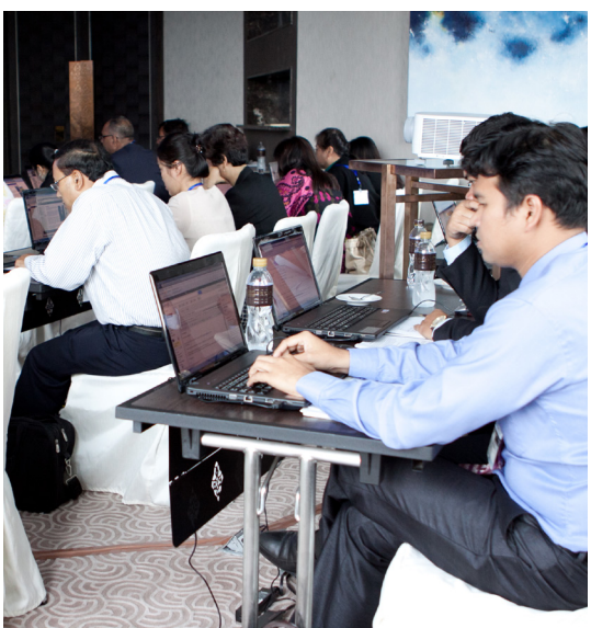
Through regional forums and training workshops, the Asia LEDS Partnership facilitates peer-to-peer learning and sharing of tools, models, approaches, and good practices in low-emission, climate-resilient development.